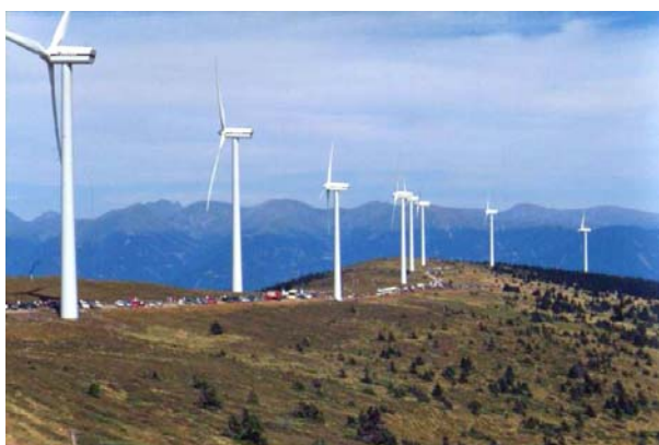
Figure 2: Wind park in Austria. REE are used to make high-performance magnets which are used in wind turbines.

With new and developing technologies, the uses of REE have extended from well-established applications such as glass polishing, to include high-performance magnets, high-tech catalysts, electronics, glass, ceramics, and alloys 3,4 . An increasingly important area of REE use is in low-carbon technologies.