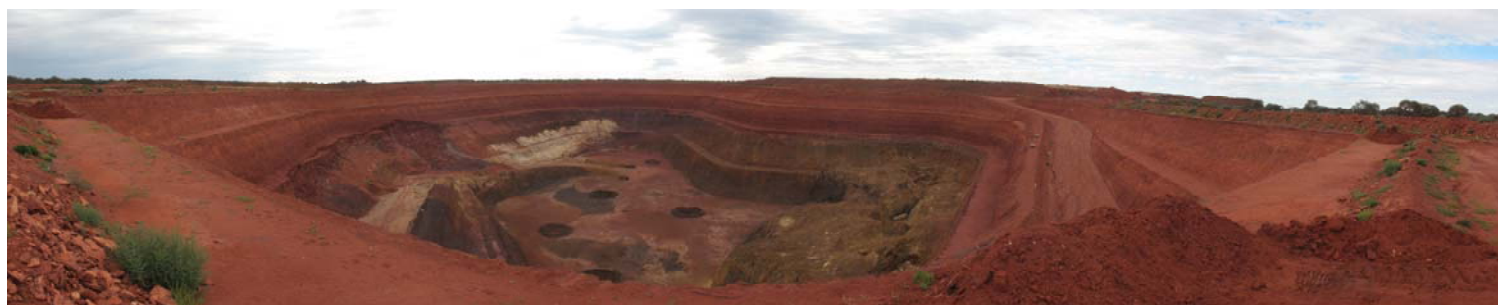
Figure 6: Mount Weld, Western Australia

A 2002 report by the United States Geological Survey listed 822 occurrences of REE in a wide variety of rock types, about 20% of which are carbonatites 9 . As at June 2011, there is also active exploration in alkaline igneous rocks, mineral sands, and hydrothermal deposits.