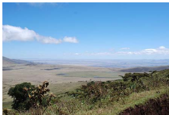
Figure 5: East African Rift Valley, Tanzania.

The carbonatites and alkaline igneous rocks are characteristically found in the interiors of tectonic plates, that is, away from the active plate margins where volcanic activity is at its greatest. They are commonly associated with the major rift systems, such as the East African and Baikal rifts and the Rhine Graben. The carbonatites are mostly confined to continental areas, while the alkaline rocks also occur over much of the world's oceanic intraplate areas on volcanic islands. Although more than two thirds of carbonatites that have been dated are Phanerozoic in age (less than 500 million years), they are overwhelmingly concentrated in areas comprising older Precambrian rocks.