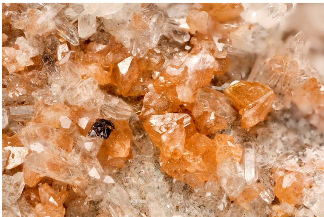
Figure 4: Monazite-(Ce) specimen from Siglo XX mine, Bolivia – the orange mineral is monazite, and the clear one quartz. Photo credit: Natural History Museum (specimen no: BM 1972,348)

The most important rare earth minerals in ore deposits are bastnäsite and monazite-(Ce) ( \text{CePO}_4 ). Each contains about 70% rare earth oxides by weight. Other significant ones are the carbonates parisite-(Ce) and synchysite-(Ce) (often found intergrown with bastnäsite), and the phosphate xenotime-(Y).