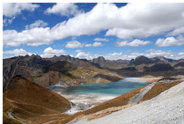
Figure 9: Tailings pond – waste materials could be a source of economic extraction.

A separate alternative to substitution and recycling of rare earths is to evaluate potential novel, previously unconsidered, resources such as waste materials from mining operations for other commodities and from industrial processes. 'Secondary' resources of these types not only have the potential to extend the resource base for REE, but also have a smaller environmental footprint than exploiting primary ores, maximising the efficiency of resource use and reducing the amount of potentially harmful waste from industrial processes. Research is underway to