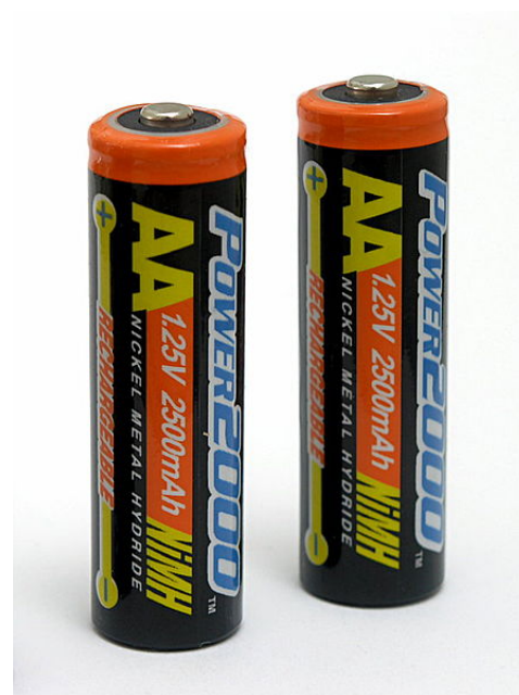
Figure 3: NiMH batteries, an example of use of REE.

Demand for REE in all these applications is expected to continue to increase over the next few years, particularly in the manufacture of magnets.