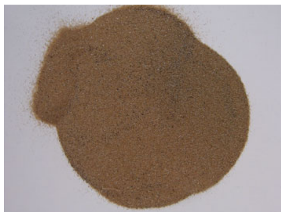
Figure 7: Powdered monazite, a rare-earth-and-thorium-phosphate.

There are many known minerals which contain some REE, but in most cases neither the minerals nor the REE themselves can yet be economically extracted and separated.